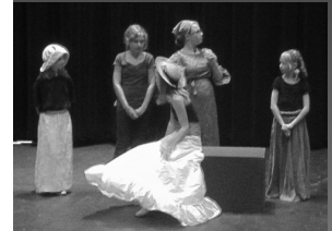
"Here comes trouble"

Weeks of planning by the directors made for an enjoyable and entertaining week as well as showcase, which kept the children entertained and involved. A grand time was had by all!