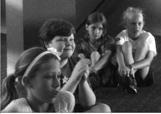
Paying close attention at the day camp.

This past July Attic held our second Theatre Day camp session for four afternoons, concluding with a showcase for families and friends.